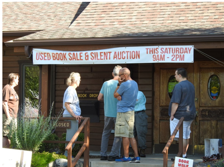
Right: Community members patiently waiting for the Book Sale and Silent Auction to begin.