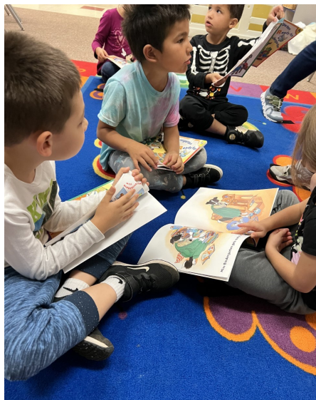
Left: Kindergarten-ers reading their new books gifted by Friends of Land O’ Lakes Library.